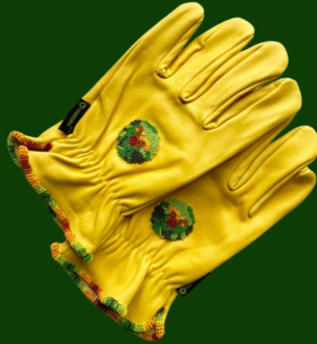
Olivia Whetung, Jewelled gloves, 2022. Ready-made leather garden gloves and seed beads.

Guest curated by Mona Filip January 27 to April 7, 2024