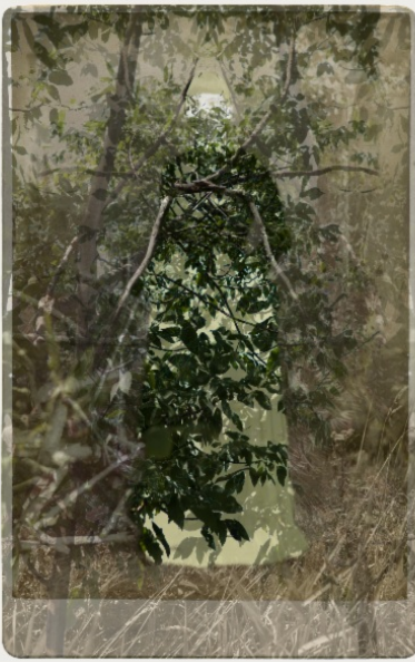
Sara Angelucci, Undergrowth , 2024. Digital print, 60" x 80" x 3/4".