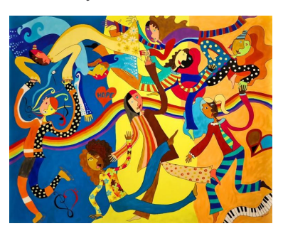
Compromising Fears Michele Taras