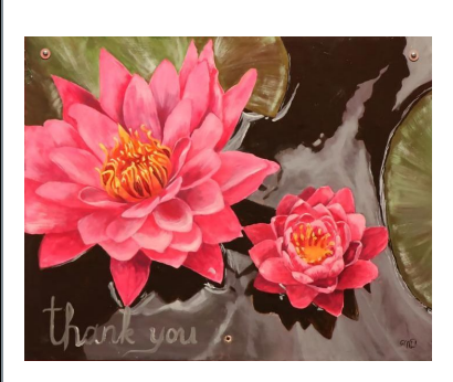
Flowing River, Lotus of Thanks 27 Local Artists