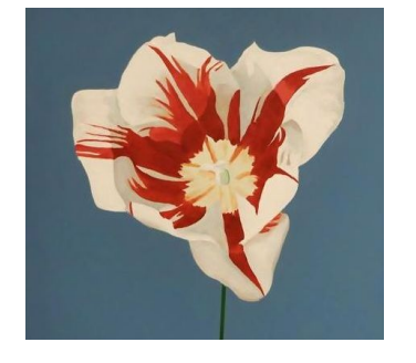
Garden of Healing Charles Pachter