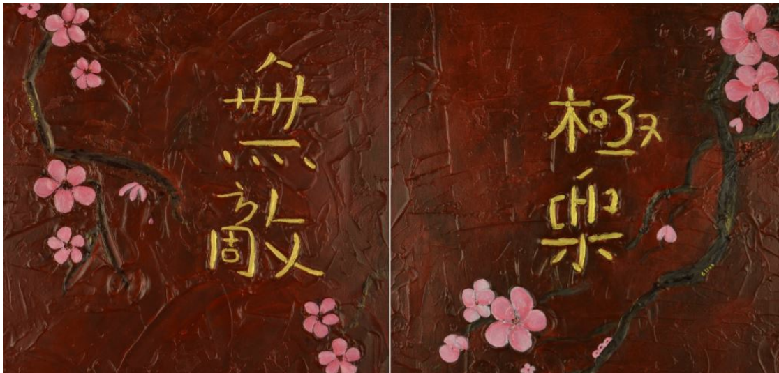
Invincible (L) Bliss (R)